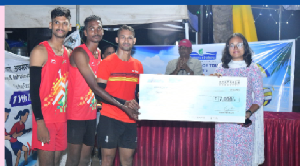
Winner of Volleyball (Men's)