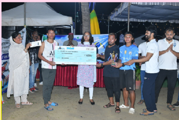
Runner-up of Tug of War (Men's)

With pleasant monsoon showers adding colour to the evening and a cheerful weekend crowd that exceeded expectations, the event truly turned into a community celebration. It was a long-awaited gathering where sport met celebration and tradition met enthusiasm, leaving everyone looking forward to the next edition. The tournament reinforced the Tourism Department's vision of positioning the Andaman & Nicobar Islands as a thriving destination for eco-tourism, adventure sports, and cultural harmony. The Department of Tourism has extended sincere gratitude to all participants, volunteers, supporting Departments, and the ever-spirited spectators for making this event a resounding success.