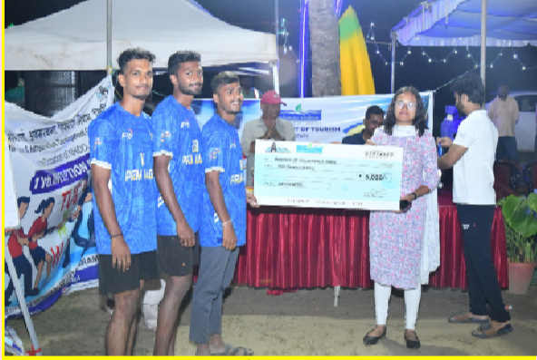
Runner-up of Volleyball (Men's)