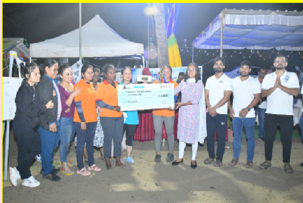
Runner-up of Tug of War (Women's)