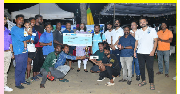
Winner of Tug of War (Men's)