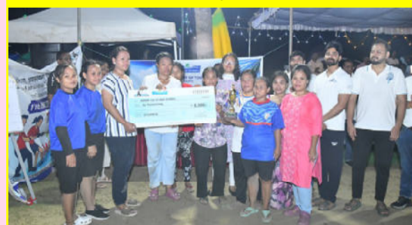
Winner of Tug of War (Women's)