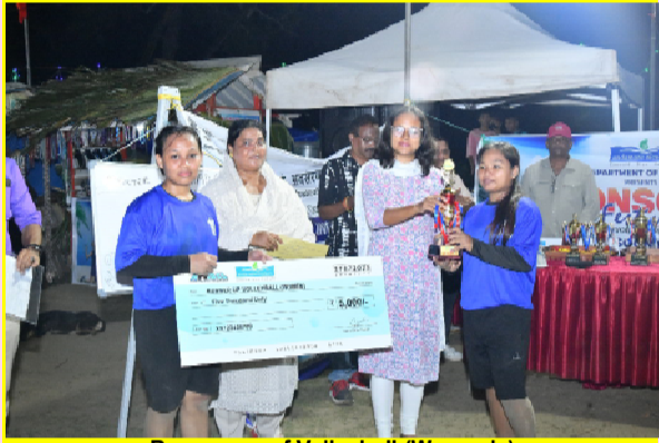
Runner-up of Volleyball (Women's)